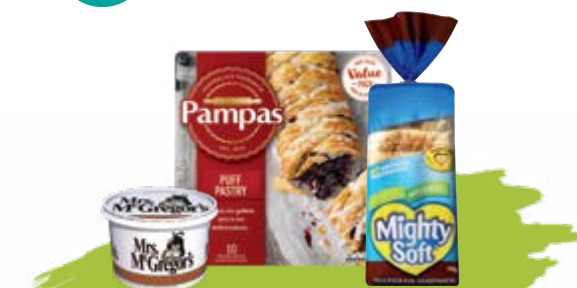
Loaf, Spreads and Pastry