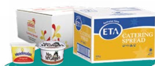
Margarine and Spreads