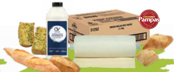
Artisan, Mayo, Garlic Breads and Pastry