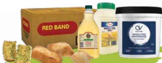
Mayo, Garlic Bread, Artisan, Tallow and Vinegar