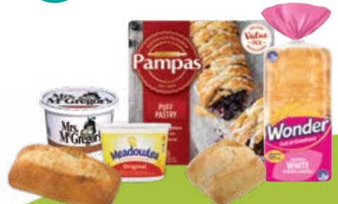
Artisan Breads, Spreads, Breads and Pastry