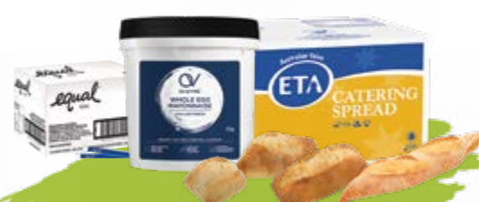
Artisan, Mayo, Spreads and Equal