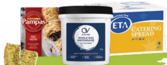
O&V Mayo, Garlic Bread, Spreads and Pastry