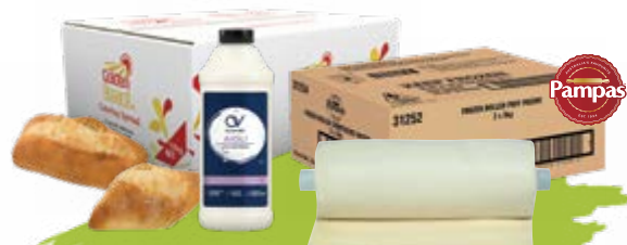
Pastry, Artisan, Spreads and Mayo